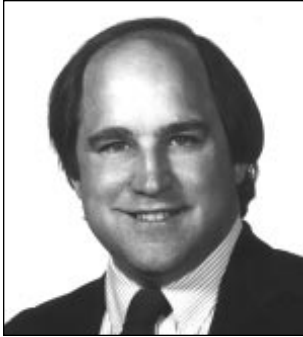
Prof. Ronald Rivest is co-inventor of the RSA public-key cryptosystem, a co-founder of RSA Data Security Inc. and a distinguished associate of RSA Laboratories.

One of the nicest features of cryptographic research is the speed with which developments occur. This is